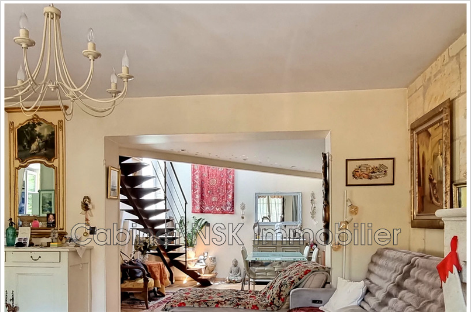
Village house 0054 Saint-Denis-de-Pile

Fees paid by the owner, no current procedure, information on the risks to which this property is exposed is available on georisques.gouv.fr .